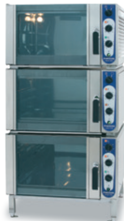
Oven group Chef 220