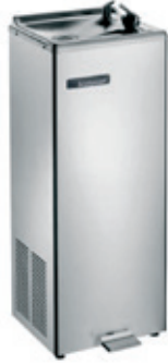
SCW 14 FP