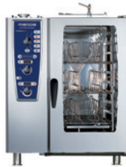
Combimaster Plus 101