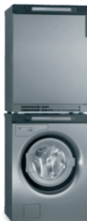
SC65 + DAM6